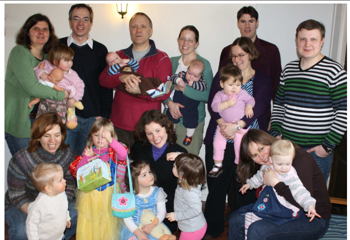
Above: First Christian Family Home Training Retreat.